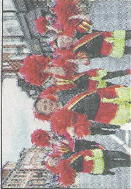
Above: Modern carnival action. Right: Memories from 1923, the earliest recorded carnival.

Then as the town show ceased, Farnham Lions also took on the running of the carnival fair, now held in Gostrey Meadow.