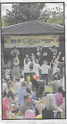
Above and right: Groups taking part in the procession in previous years. Below: In Gostrey Meadow.

Organised by The Hedgehogs and Farnham Lions, carnival day is not just about the procession, as there is lots going on throughout the day too. In fact, the fun kicks off at 2pm when the Carnival Fayre opens in Gostrey Meadow. The Farnham Brass Band will play on the bandstand and then there be bands on the stage throughout the day. There will be stalls, sideshows, food and drink and a separate children's corner with games and entertainment, a fun fair and a Punch & Judy show. There will also be a new craft marquee in honour of Farnham's status as a craft town. Go along and have fun!